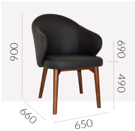
Timber 4 Leg