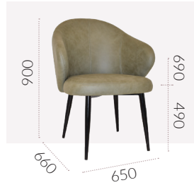
Metal 4 Leg